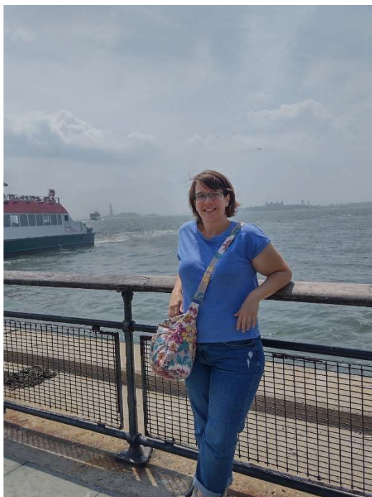
New York City! The Statue of Liberty is just about visible in the distance.

After all that I had a quiet couple of months through the summer, and I definitely appreciated the chance to stop moving and rest! I (finally!) caught covid-19 in July, and although I felt quite unwell for a few days I recovered quickly and have no long-term effects. August has been a lovely month of days out with friends (both local and visiting from England), and days alone to rest, read and reflect.